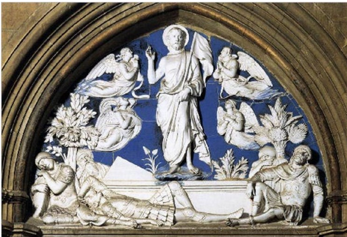
The Resurrection of Christ

Thank you for joining with members of Christ Church, Aspen in this moment of prayer and reflection. Please like, share, or forward this web cast. If you would like to support Christ Church's ministry, you can find a donate button on christchurchaspen.org . May you enjoy a blessed Easter and delicious feast with your household and may we all gather next year in our churches to celebrate Easter together.